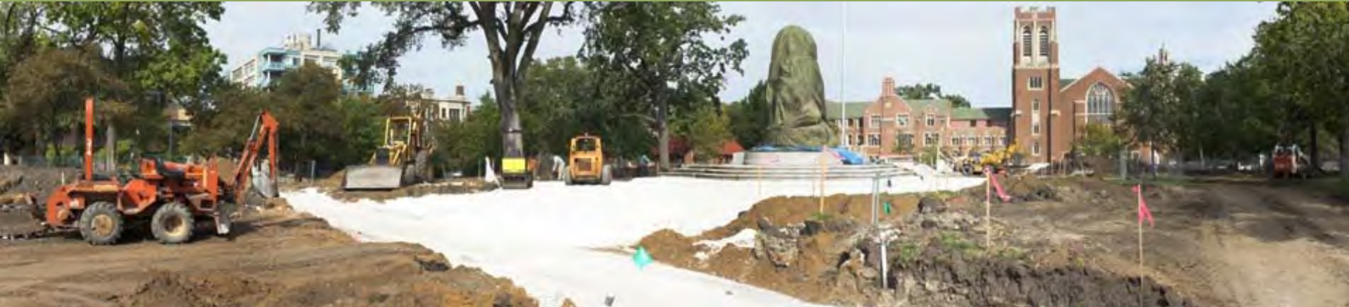
Major Trees Protected by Root Pruning & Root Aeration Matting