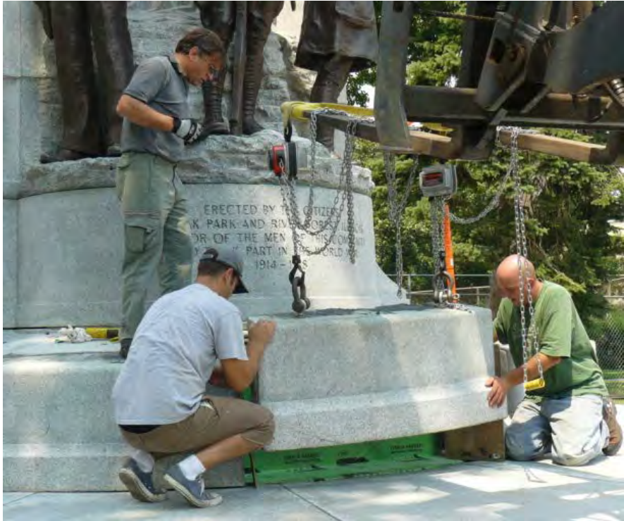
Conservation by Sculpture & Objects Studio, Forest Park, IL