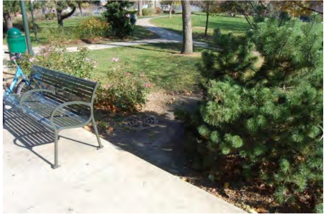
People wore a path through the planting to Library